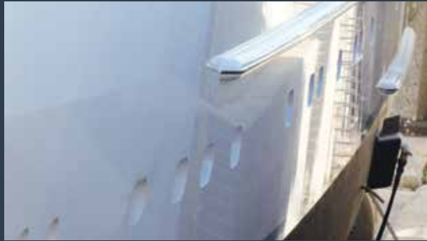
Result: Before (dull) and after (gloss)