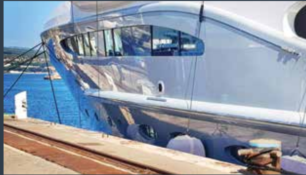
Yacht: Coated with Crystilium™