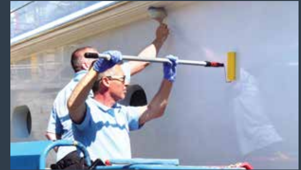
Application of Crystilium™