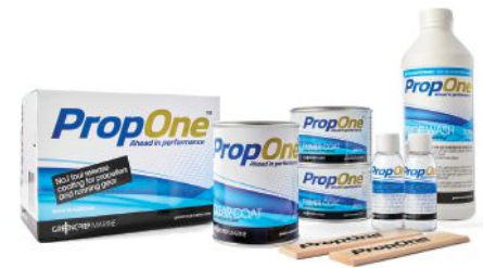
The PropOne range